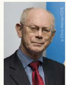
Herman VAN ROMPUY President Emeritus of the European Council Former Prime Minister of Belgium President of CIFE